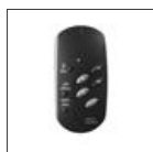
INTERACTIVE-DALI remote control. M104900