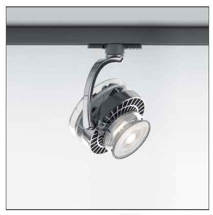
IP 20 Dimmerable: + 10-