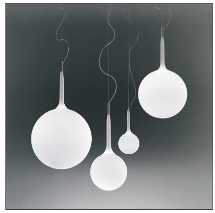
IP20 ⊕ % v e c c c Dimmerable: + () -