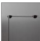
AGGREGATO SOSP ROSONE DECENT A086000