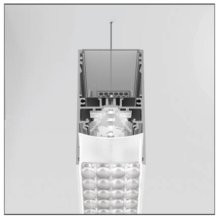
IP 20 ☐ Dimmerable: + ① -