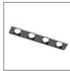
Louvre - 2368mm 4x4 optics white AE42001