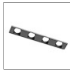
Louvre - 1184mm 2x4 optics white AE40001