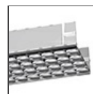
Algorithmo System LED - Optics - Controlled Emission - 1184mm M186700