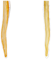
Bright Gold (06)