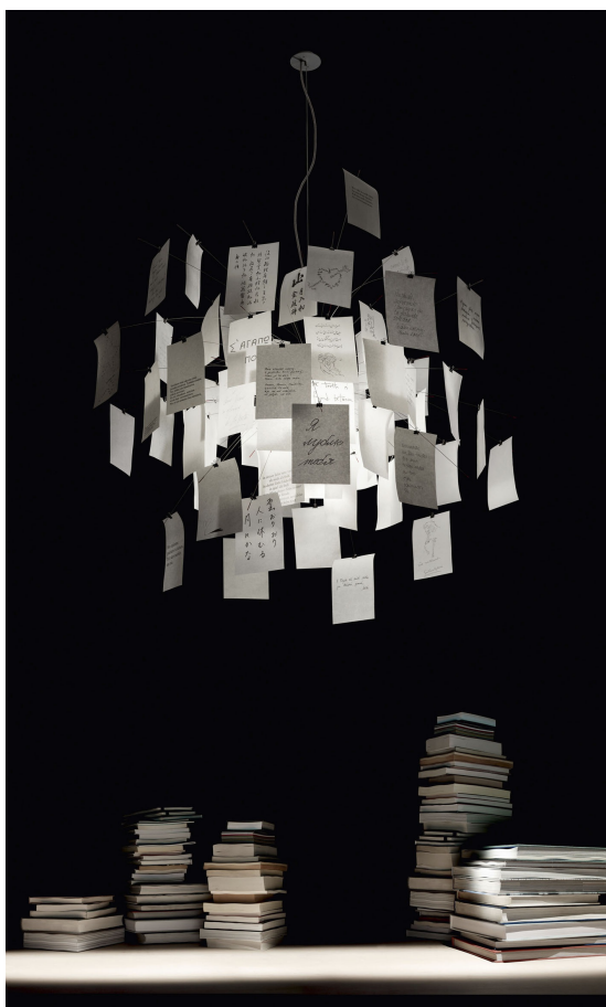
Zettel'z 5 INGO MAURER 1997

Stainless steel, heat-resistant satin-frosted glass, Japanese paper. 31 printed and 49 blank paper sheets DIN A5. The Zettel'z 5 is one of Ingo Maurer's best known lamps. It gives the user plenty of room for his or her own creativity, and can be set up so that it is space-consuming and loose or narrow and dense. The blank sheets of paper supplied with it are designed to be used for your own messages or sketches. The Japanese paper is very thin and translucent. Two bulbs provide good light.