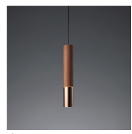
₱$ 320F-242: Walnut