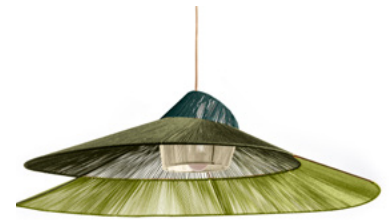
jungle green/green brown/ mint green/pink beige 00AMFLS3M-C