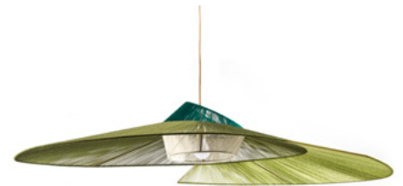
jungle green/green brown/ mint green/pink beige 00AMFLS3L-C