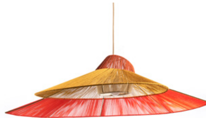
flame red/papyrus gold/ copper orange/mist grey 00AMFLS3M-B