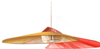
flame red/papyrus gold/ copper orange/mist grey 00AMFLS3L-B