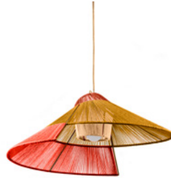
flame red/papyrus gold/ copper orange/mist grey 00AMFLS3S-B