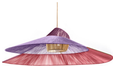
blackberry purple/mauve/ soft pink/pink beige 00AMFLS3M-A