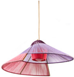
blackberry purple/mauve/ soft pink/pink beige 00AMFLS3S-A