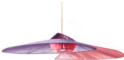
blackberry purple/mauve/ soft pink/pink beige 00AMFLS3L-A