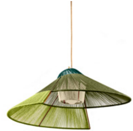
jungle green/green brown/ mint green/pink beige 00AMFLS3S-C