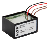
Code: 106 Supported n. of lamps: 2 Power supply dual function Vout 24Vdc: 8W/100÷240V Iout 350mA: 6X1W/100÷240V - IP65 CLASS II SELV EQ.