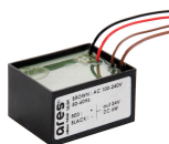
Code: 106 Supported n. of lamps: 1 Power supply dual function Vout 24Vdc: 8W/100÷240V Iout 350mA: 6X1W/100÷240V - IP65 CLASS II SELV EQ.