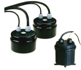
Code: 17 Transformer 200W 230V/12V 50Hz IP 66