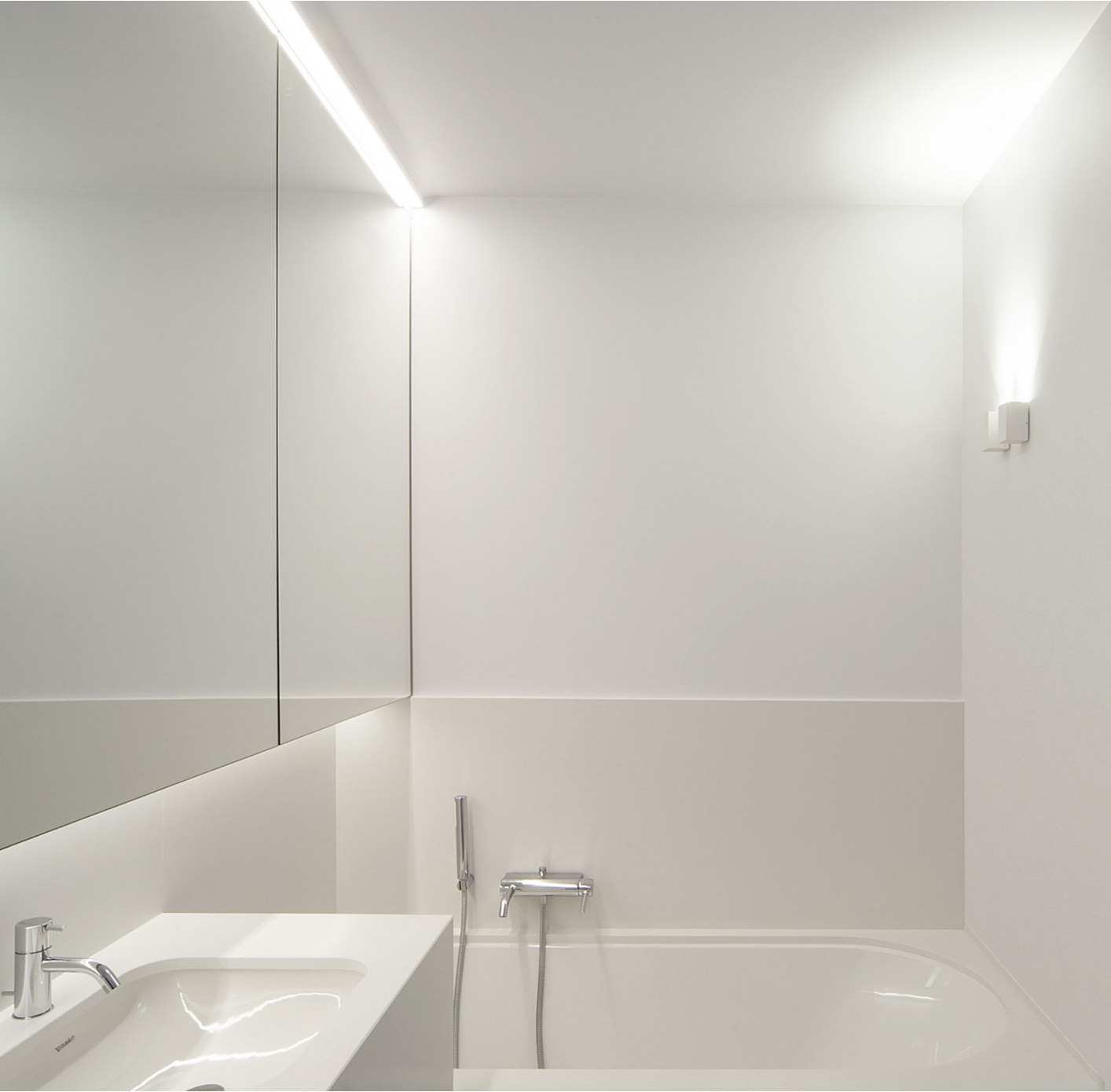
PRIVATE RESIDENCE DUINBERGEN | BELGIUM