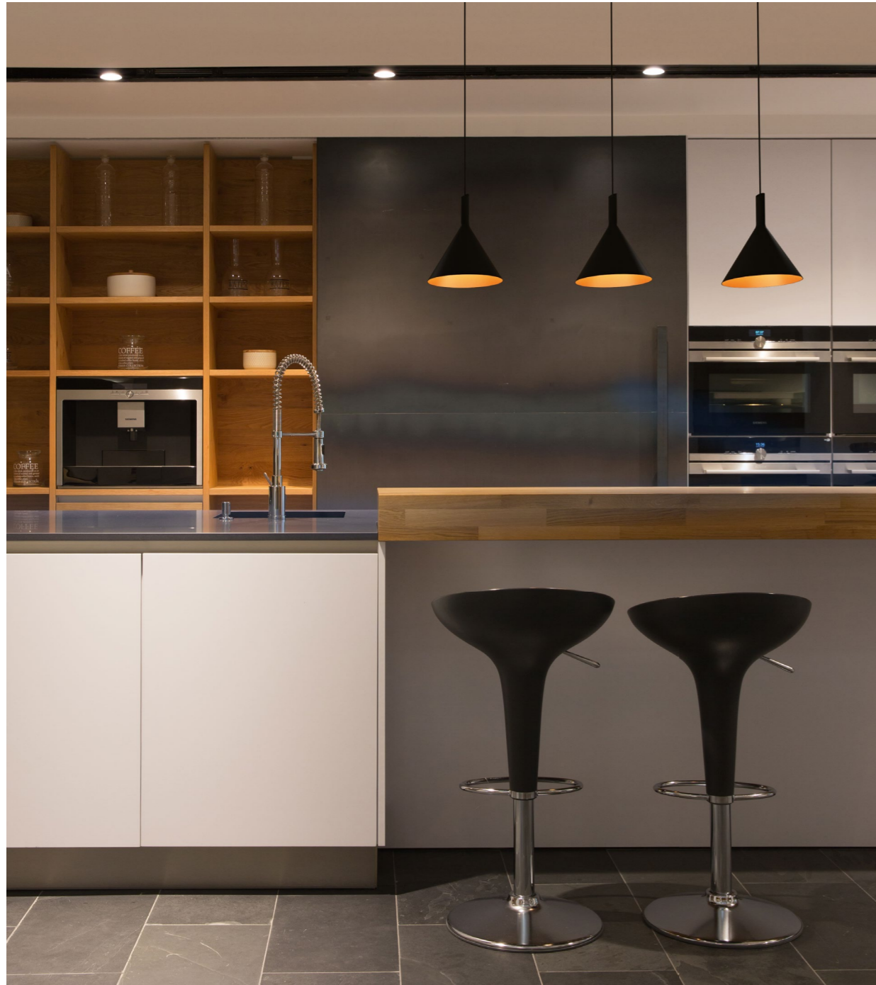
SHOWROOM | MÖBEL KARNER GÄNSERNDORF | AUSTRIA