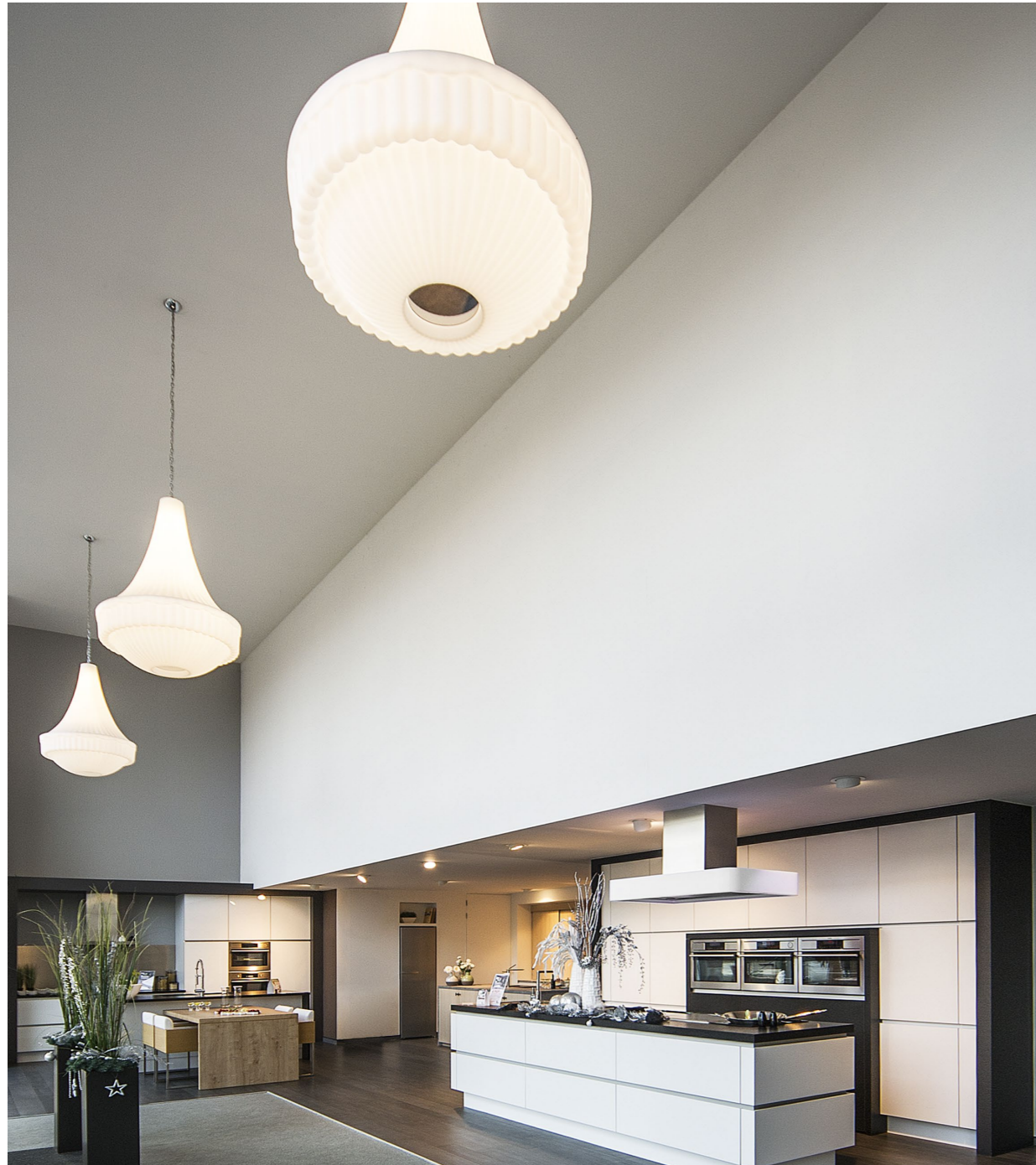
SHOWROOM KITCHEN DOVY ROESELARE | BELGIUM