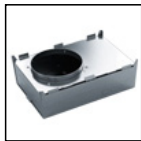
S.7369 HOUSING FOR CONCRETE CEILINGS Dim. 400 x 260 x 170mm