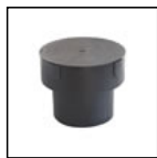
S.5510 ROUND RECESSED BOX For cement ceiling installation Dimensions: Ø 121÷165 mm h 135 mm