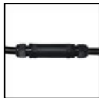
FAST CONNECTOR INCLUDED