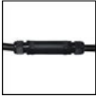
FAST CONNECTOR INCLUDED