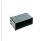
S.4673 RECESSING BOX 77 x 198 mm. Width 120 mm

Available until 31/12/2017 but subject to stock levels