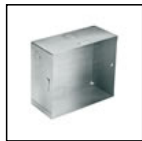
S.4633 RECESSING BOX SQUARE 284 x 284 mm. Width 142 mm.