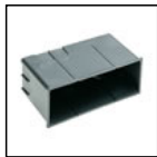
S.4523 RECESSING BOX RECTANGULAR 263 x 135 mm. Width 95 mm.