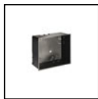
S.4613 RECESSING BOX Dimensions 98 x 98 mm Width 95 mm