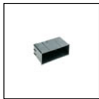
S.4553 RECESSING BOX 184 x 74 mm. Width 90 mm