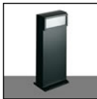
S.4550 BOLLARD ACCESSORY Die-cast aluminium column. Base 240 x 160 mm H = 550 mm Black (code 09).

TO BE USED WITH THE FOLLOWING ACCESSORIES: S.4372 FLANGE FOR BOLLARD Order luminaire STRIP S.4659 separately.