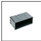
S.4503 RECESSING BOX 220 x 92 mm. Width 95 mm