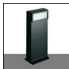
S.4550 BOLLARD ACCESSORY Die-cast aluminium column. Base 240 x 160 mm H = 550 mm Black (code 09).

TO BE USED WITH THE FOLLOWING ACCESSORIES: