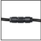
FAST CONNECTOR INCLUDED