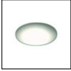
S.3911 EXTENSIVE LENS

All the lenses and the coloured filters must be installed below the front glass. It's possible to install only an accessory at a time, so it's not possible to install coloured filters and lenses together.