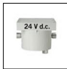
S.3664 JUNCTION BOX WITH POWER SUPPLY 22W 240V/24V d.c. IP65 power supply for: N°3 Micropool LED* or N°1 Minipool LED maximum load capacity 500Kg Dimensions 200mm x200mm x220mm *= require 1 x S.3670 additional cable gland