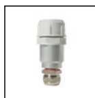
S.3670 1 ADDITIONAL CABLE GLAND Required for the connection of over 2 luminaires to the junction box /power supply.