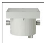
S.3660 JUNCTION BOX IP65* Junction box with cable glands for 3 cables IN (possibility of 3 more cables IN with S.3670 accessories) Maximum load capacity 500Kg Dimensions 300mm x300mm x230mm