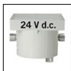
S.3665 JUNCTION BOX WITH POWER SUPPLY 70W 240V/24V c.c. IP65 power supply for: N°4 Micropool LED** o N°3 Minipool LED* or N°2 Pool LED maximum load capacity 500Kg Dimensions 300mm x300mm x230mm ** = require 2 x S.3670 additional cable gland * = require 1 x S.3670 additional cable gland