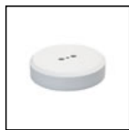
S.3671 FLANGE Fixation base plate installation. Kg 1,5