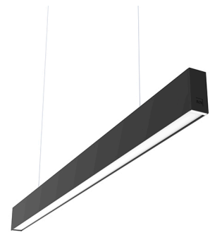
In-Finity 35 Suspension Down 4000K Micro-Prismatic Diffuser designed by FLOS Architectural