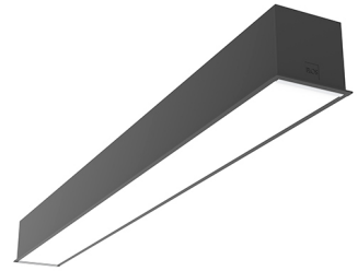
In-Finity 100 Recessed Trim 3000K General Lighting Dali designed by FLOS Architectural