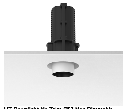
UT Downlight No Trim Ø57 Non Dimmable designed by FLOS Architectural

Recessed luminaire with LED light source. 220-240V, 50-60Hz remote power supply included.<nextline>