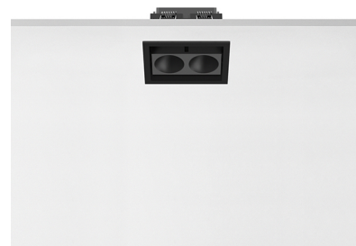
Light Shadow Adjustable Trim Dali Version 2 Spots Optic Spot