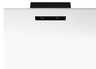
The Black Line No Trim 2 Spots designed by FLOS Architectural

Maximum length of 2.5 mm 2 secondary conductor (m): 30