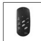
INTERACTIVE-DALI remote control. M104900