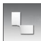
SURF GIUNTO 90° BCO M090320