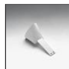
SURF ATTACCO A PARETE BCO M090820