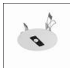
INTERACTIVE-DALI kit Ø86mm, white, recessed. Can be connected to a max. 11 DALI dimmable units. Is operated through INTERACTIVE-DALI remote control or external push button. M074030