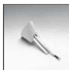
SURF ATTACCO A PTE ALIM.BCO M090920