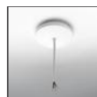
SURF BASETTA SOSP.ALIM.BCO M090720