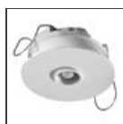
Extension movement detector white, recessed. To be used when the area to be covered is bigger than 6,00x5,00m by height 2,50m. To be connected to one of the outputs of the INTERACTIVE-DALI controller. No extra mains connection required. M074130