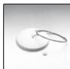
SURF BASETTA SOSP.BCO M090620