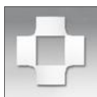
SURF ELEMENT DE JONCTION + BLC M090520