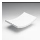
SURF TERMINALE BCO M090220