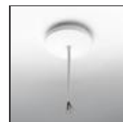
SURF SOSPENS. ALIM.5 POLI BCO M091820