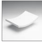
SURF TERMINALE BCO M090220