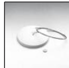
SURF BASETTA SOSP.BCO M090620