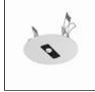
INTERACTIVE-DALI kit Ø86mm, white, recessed. Can be connected to a max. 11 DALI dimmable units. Is operated through INTERACTIVE-DALI remote control or external push button. M074030