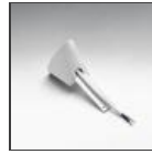
SURF ATTACCO A PTE ALIM.BCO M090920