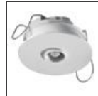
Extension movement detector white, recessed. To be used when the area to be covered is bigger than 6,00x5,00m by height 2,50m. To be connected to one of the outputs of the INTERACTIVE-DALI controller. No extra mains connection required. M074130