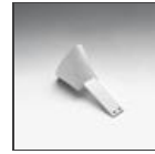
SURF ATTACCO A PARETE BCO M090820