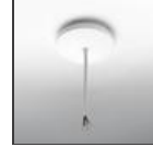
SURF SOSPENS. ALIM.5 POLI BCO M091820