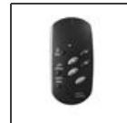
INTERACTIVE-DALI remote control. M104900