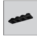
Screen 4x Black AF95204