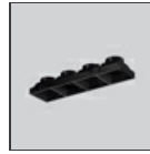
Screen 4x White AF95201

Driver CV 30W 24Vdc Selv - 220- 240 Vac - 153x41x32 (LxWxH) - up to 25W - Undimmable DV1032