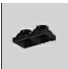
Screen 2x Black AF95104