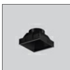
Screen 1x White AF95001