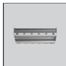
Recessed frame 4x AF90200