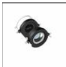
Accessory-holder (black) + Projection lens for gobo. Customized gobo to be ordered separately M083837