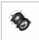
Accessory-holder (nero) + projection lens and framing device M083937