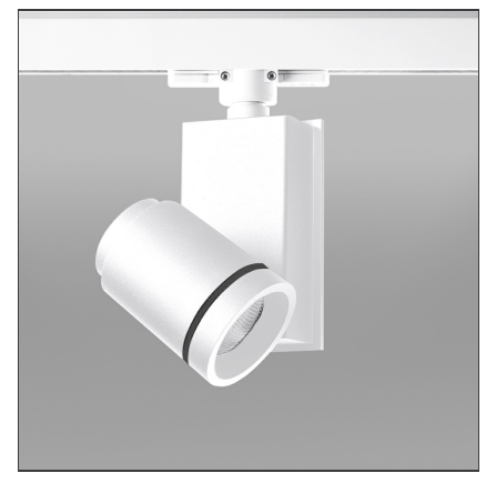
IP20 (≟) (₹$ C€