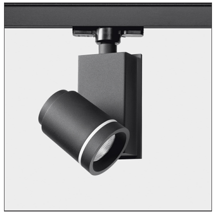
IP20 ⊕ 🕸 C€