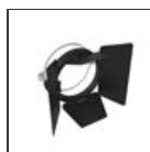
Accessory-holder (black) + Adjustable dowser (black) M082837