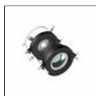
Accessory-holder (nero) + projection lens and framing device M083937