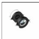
Accessory-holder (black) + Projection lens for gobo. Customized gobo to be ordered separately M083837