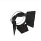
Accessory-holder (white) + Adjustable dowser (black) M082817