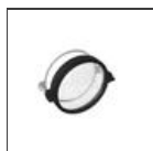
PICTO 125 - Accessory-holder (black) + Lens for elliptical light distribution. M083437