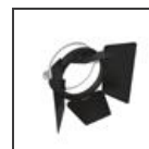
PICTO 125 - Accessory-holder (white) + Adjustable dowser (black). M082917