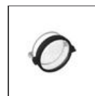
PICTO 125 - Accessory-holder (white) + Lens for elliptical light distribution. M083417